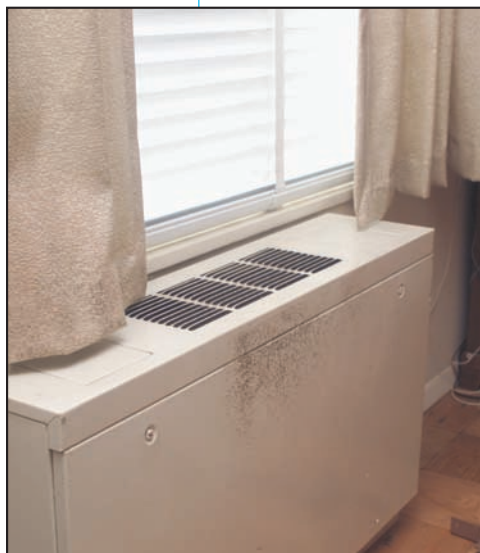
Mold growing on the surface of a unit ventilator.