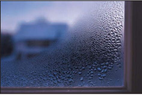
Condensation on the inside of a windowpane.